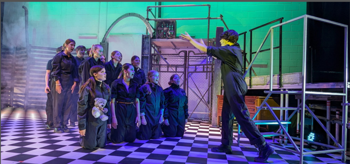
Urinetown the Musical - Brilliant Theatre Arts 2023