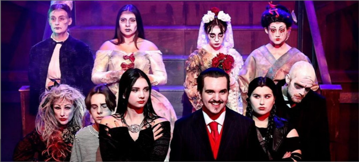
Addams Family The Musical - Limitless Academy of Performing Arts 2022