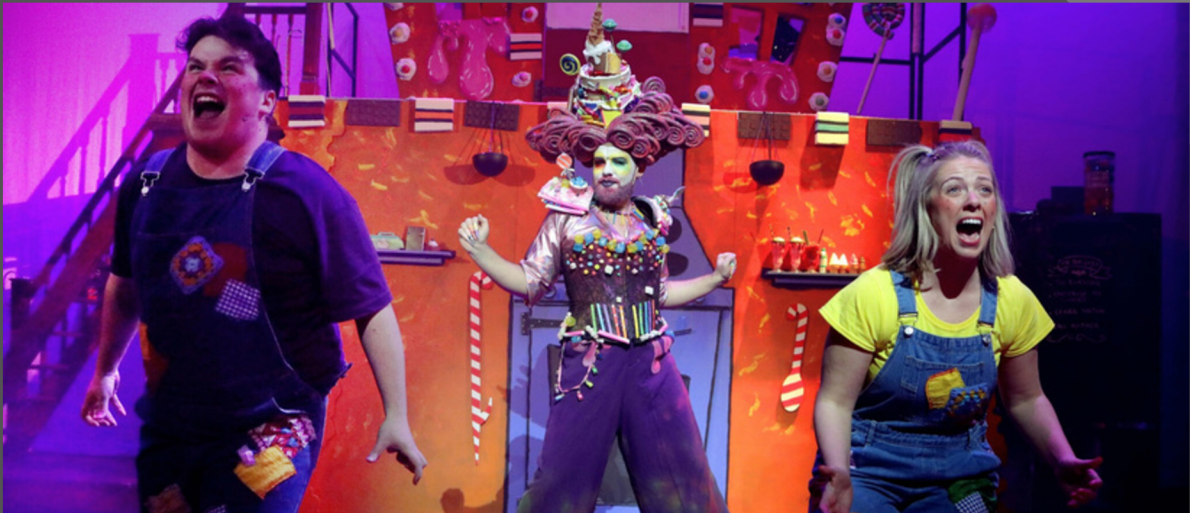
Hansel and Gretel The Pantomime - The SandPit Theatre 2022