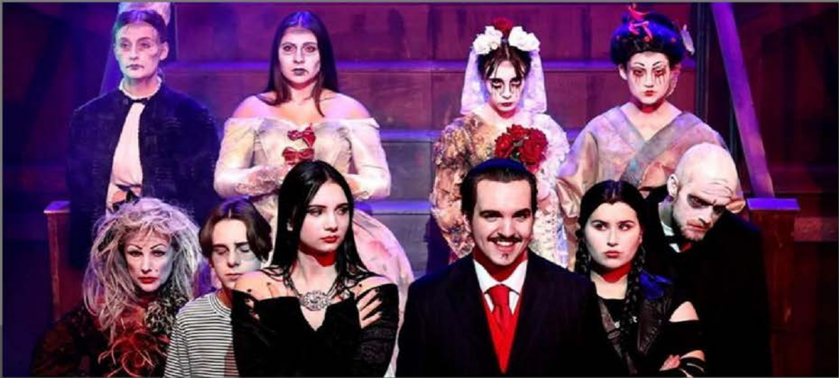
Addams Family The Musical - Limitless Academy of Performing Arts 2022