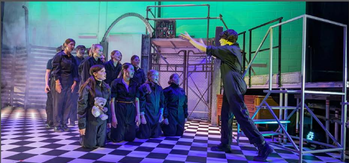
Urinetown the Musical - Brilliant Theatre Arts 2023