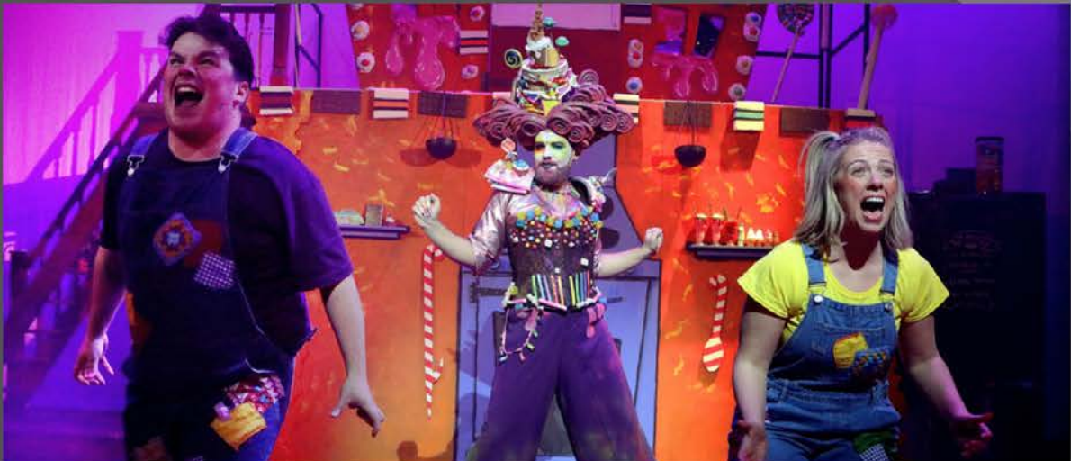
Hansel and Gretel The Pantomime - The SandPit Theatre 2022